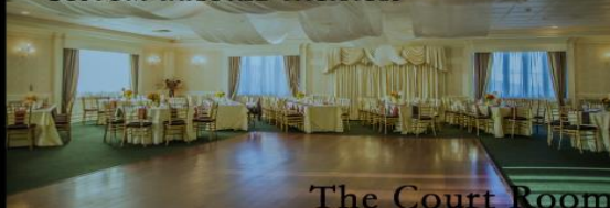
The Court Room

Full Service Catering 3 PRIVATE ROOMS CUSTOM TAILORED PACKAGES