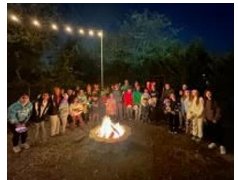
Our Junior Divisions celebrating Púca festival at AOH Division 2.