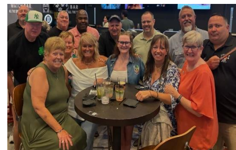
AOH & LAOH at the National Convention in Orlando 2024.