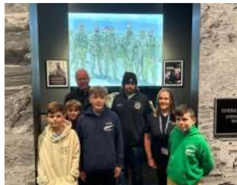
Division 7 Juniors visit to Lt. Michael Murphy Museum