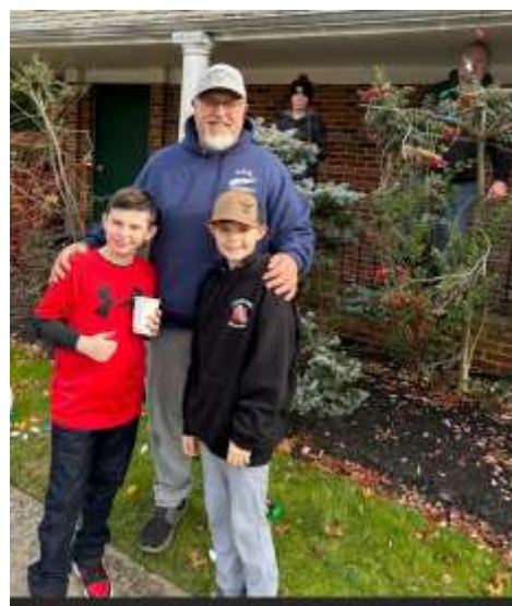
Decorating the Hall for Christmas