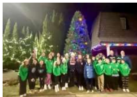
Tree Lighting Ceremony