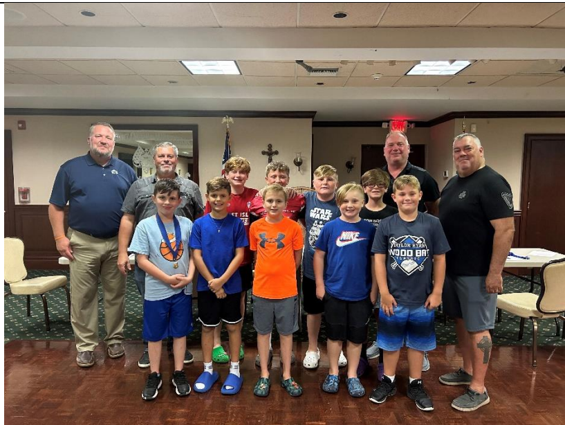
Division 7 Junior Boys at their October meeting.