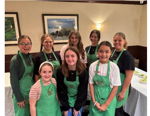
Junior Girls at their Spaghetti Dinner Fundraiser on October 20 th