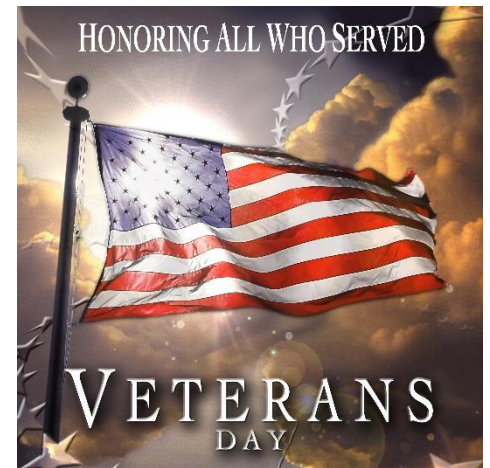
Junior Girls and Junior Boys will Host our Veterans in our Hall on Monday November 6 th at 6:30 PM