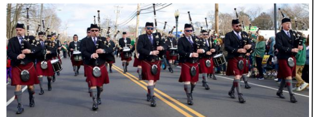
RDPB leads Div. 7 down Main St. in East Islip