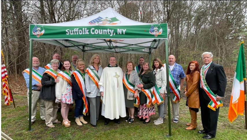
Division 7 representatives at the Tom Clarke Memorial Mass Rock