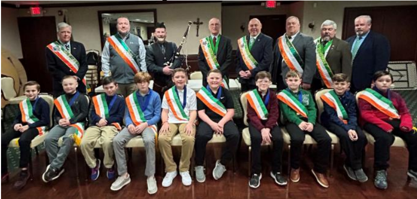
AOH Division 7 Junior Boys Division Installation February 18, 2023