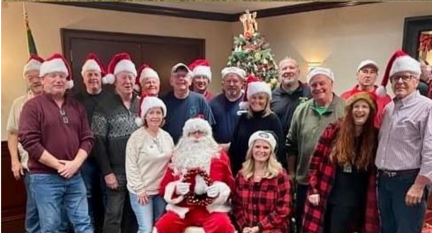
Helpers at annual Community Children's Christmas party