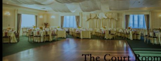
The Court Room

Full Service Catering 3 PRIVATE ROOMS CUSTOM TAILORED PACKAGES