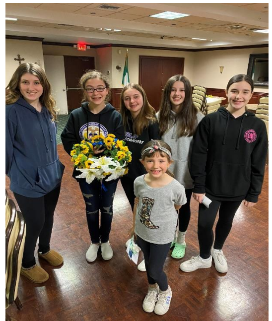
Division 7 Jr. Girls