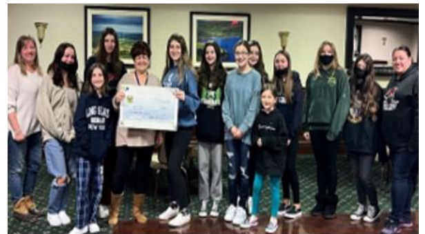
Division 7 Jr. Girls present a donation to Make-A-Wish Foundation