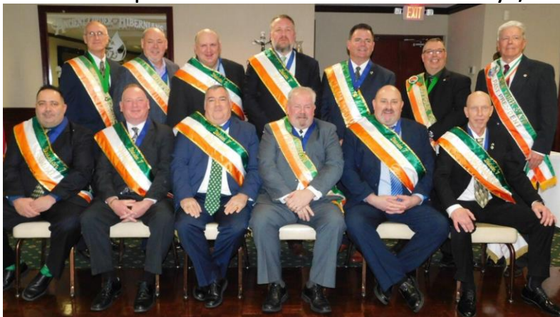
Installation of Division 7 Officers on Saturday Jan. 22, 2022