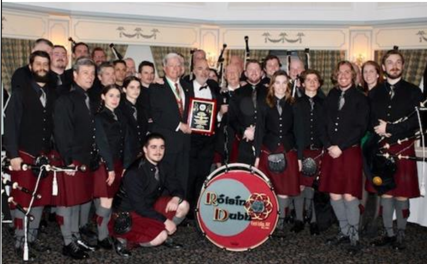
Roisin Dubh Pipe Band at the Grand Marshal Ball on Saturday 2/26

Pronunciation – Law Way-luh Paw-drig sah-nuh deev!