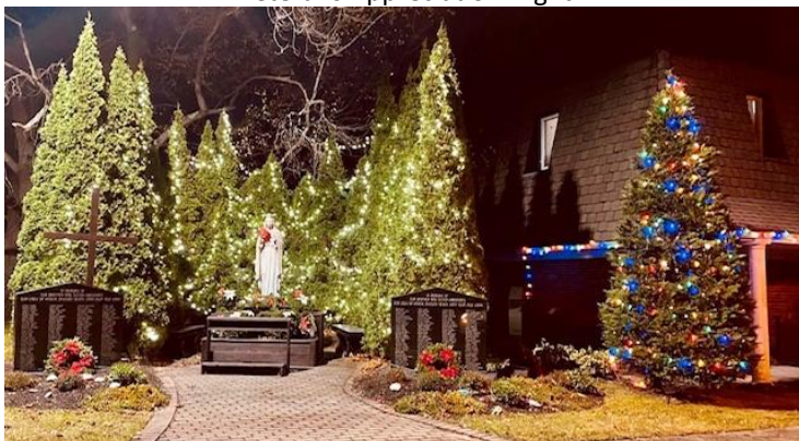
Our Lady of Knock Statue and trees decorated for Christmas