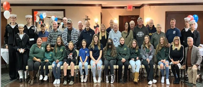
Veterans Appreciation Night

Pronunciation: Ah-vleen free gosh-ah gheev