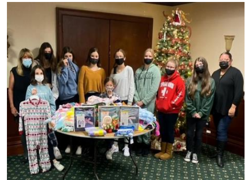
Jr. Girls Pajama drive