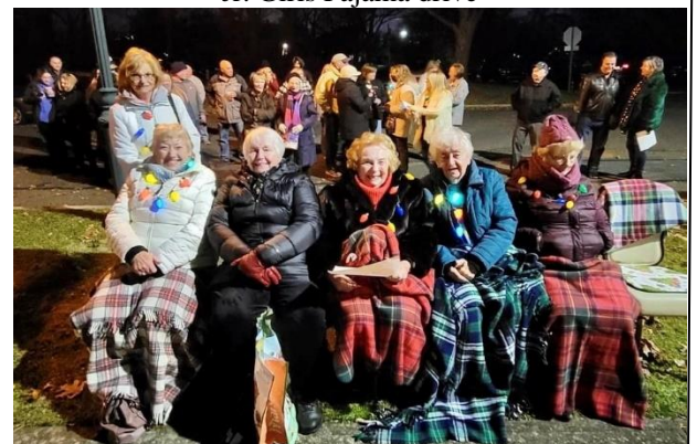
Preparing for the tree lighting celebration