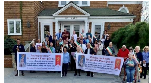
Division 7 gathered at St. Mary's to pray the Rosary on Sunday 10/16/2021