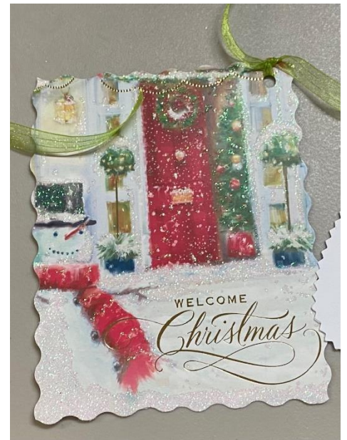
Sample of the gift tags the Jr. Girls are making for their fundraiser