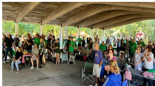
Division 7 Picnic