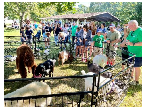
Division 7 Picnic.