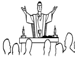
Deceased Members Mass