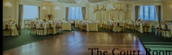
The Court Room

Full Service Catering 3 PRIVATE ROOMS CUSTOM TAILORED PACKAGES