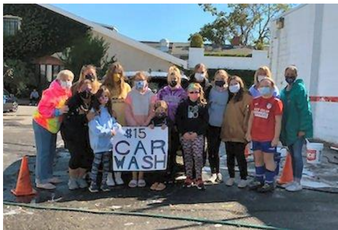
Junior Girl's car Wash for Make-A-Wish Foundation