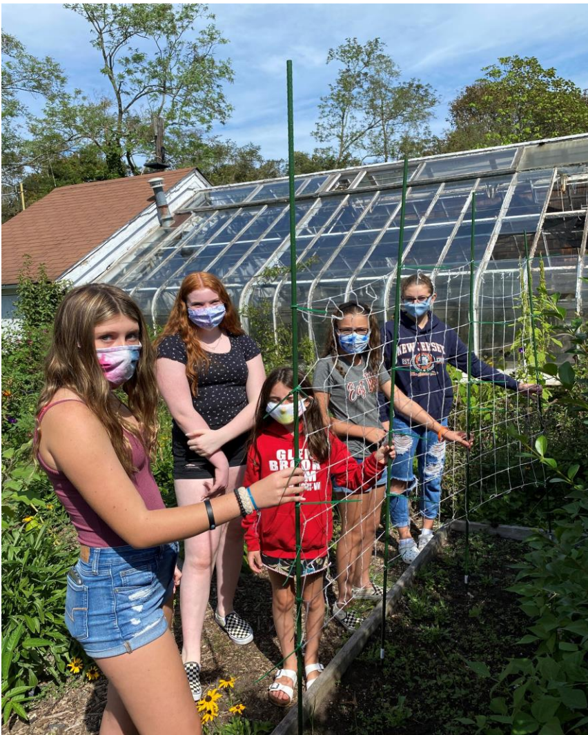
The Jr. Girls planting and tending to a Vegetable Garden located at Brookwood Hall, East Islip

Every Saturday Night we are holding a Queen of Hearts drawing at 7:30PM