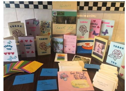
Some of the Thank You cards made by the Jr Girls