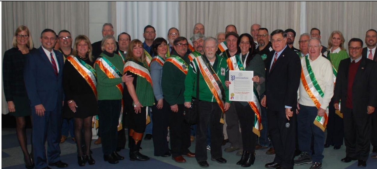
Above: Irish American Heritage Month Proclamation (Brookhaven)