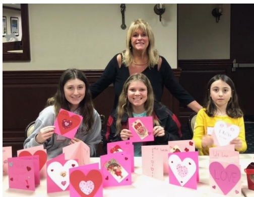
Jr. Girls make handmade Valentine's Day cards that were delivered on Valentine's Day to our homebound Division 7 AOH and LAOH members.