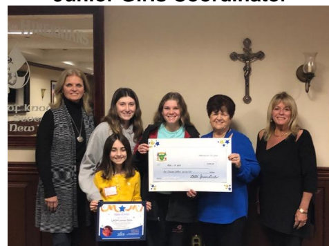
Jr Girls present check to Make-A-Wish