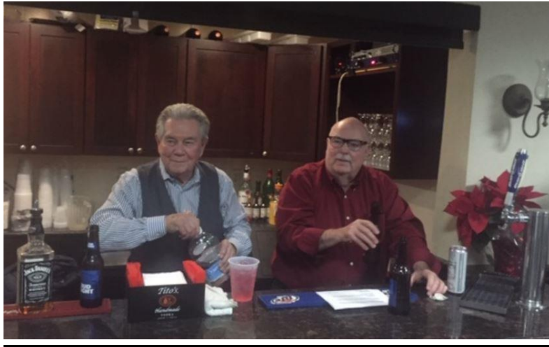
JUST LIKE OLD TIMES.