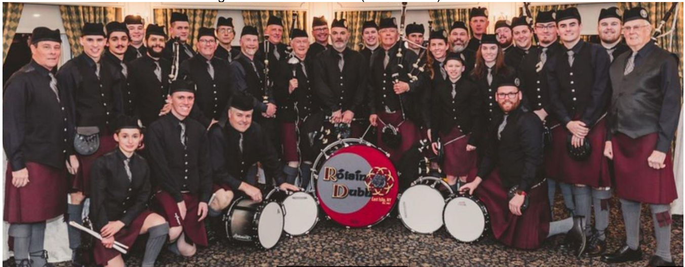
Below RDPB at our GM Ball